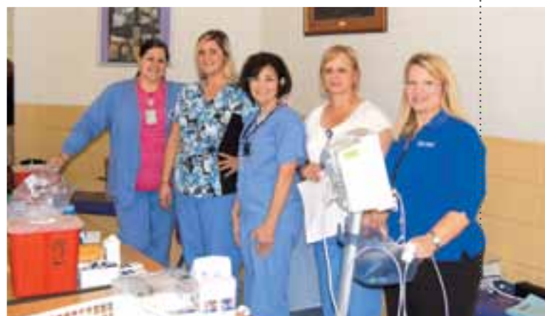
(Right) Employees doing free screenings at the Parish School Board Employees Health Fair.