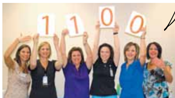
Hospital employees celebrate their weight loss.