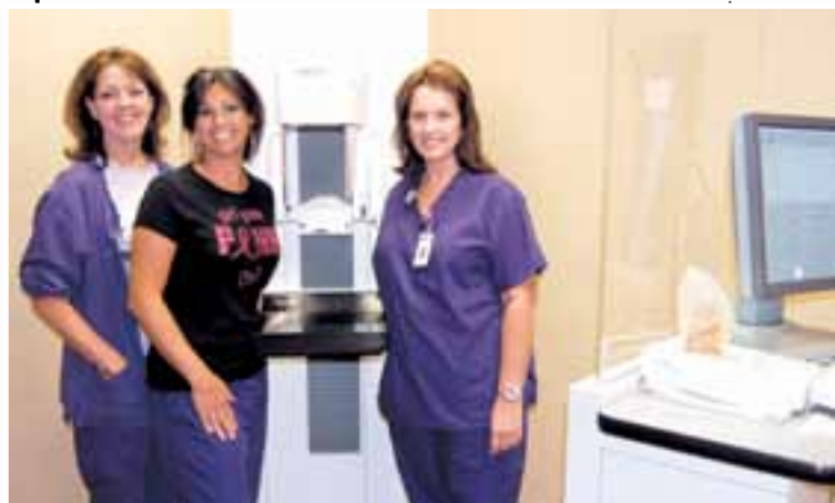
Radiology staff with the new digital mammography equipment.

—Digital Mammogram Patient, Patient Satisfaction Survey (edited for length)