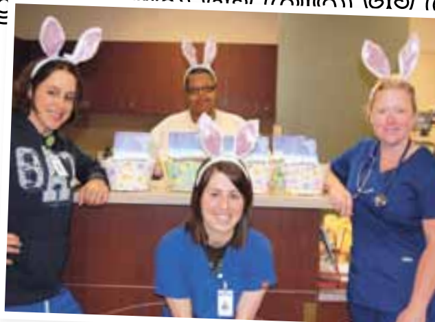
(Above) Nurses deliver baskets with goodies for patients on Easter. (Below) Parish Health Fair & Senior Picnic.