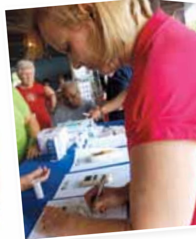
Offering cholesterol screenings at the Parish Health Fair.