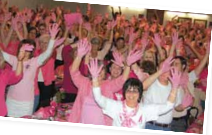
(Above) More than 700 women attend the hospital's annual Pink Ribbon event. (Right) Students of the hospital's Safe Sitter Class practice CPR skills on an infant model.