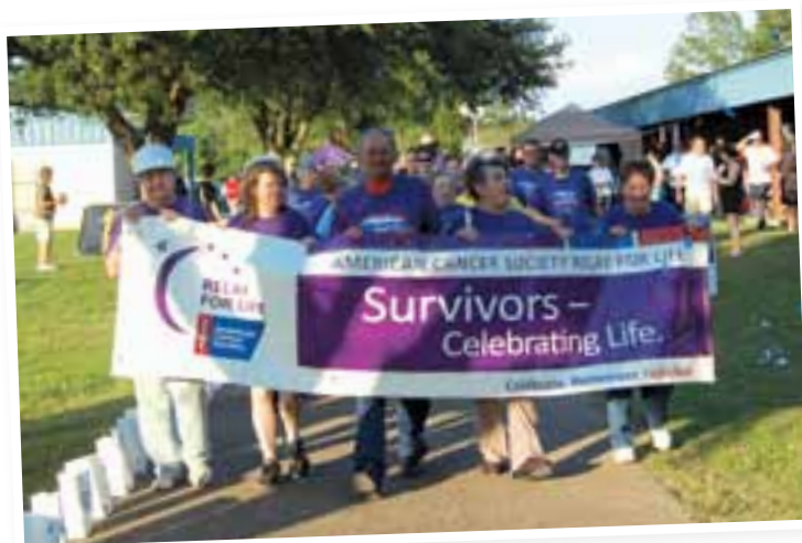
Survivor lap during 2012 Relay for Life.